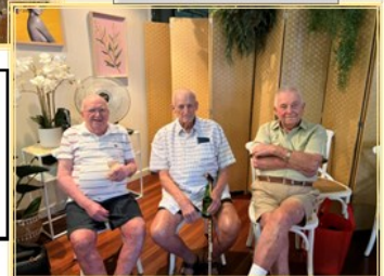
Right: Residents enjoying celebrations