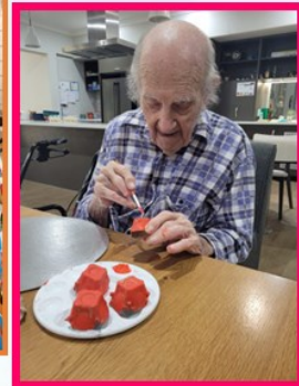
Palmview have been busy with their craft activities