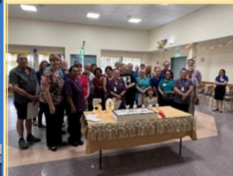
Left: Staff being recognized for their 5 years of service at the home.