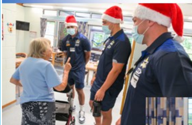
Jo from Hibiscus sorting out the North Queensland Cowboys