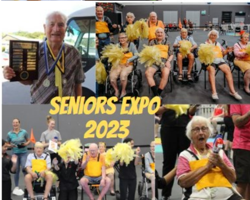
SENIORS EXPO 2023

The new Rotary Riverside Pavilion is being enjoyed by residents and their families. Since opening the Pergola has been booked for celebrations, footy tipping BBQ and recently a breakfast. Melbourne Cup again was a lot of fun and was well supported by all areas in the home. The Seniors Expo had for the first time this year a Mini Olympics which showed that residents still like to compete and win. The Good Shepherd Home were the winners. After competing a lunch was enjoyed with some very special coloured sandwiches. Well done considering other homes trained!