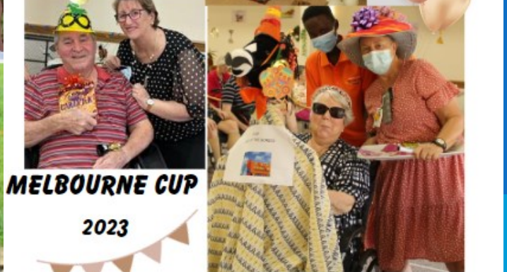
MELBOURNE CUP 2023