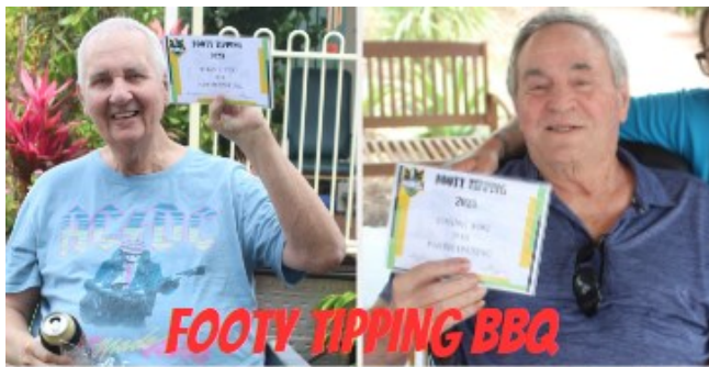
FOOTY TIPPING BBQ